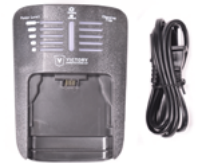
16.8 V Charger