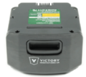
16.8 V Battery